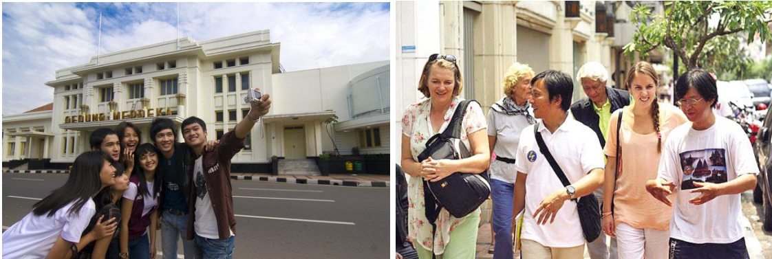
(for illustrative purposes only)

This activity will be co-coordinated with Bandung Heritage community. The community study and support the act of perseverance of historical building in Bandung. One of their campaign is to spread awareness about the importance of historical sites and share the knowledge through an activity called Bandung Historical Walk . Thus adapted to be the follow up activity for Heritage theme.